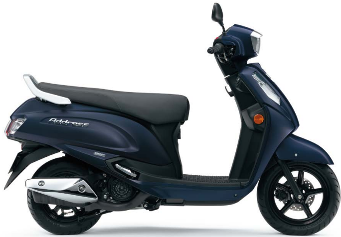
Mettalic Mat Stellar Blue (YUA)