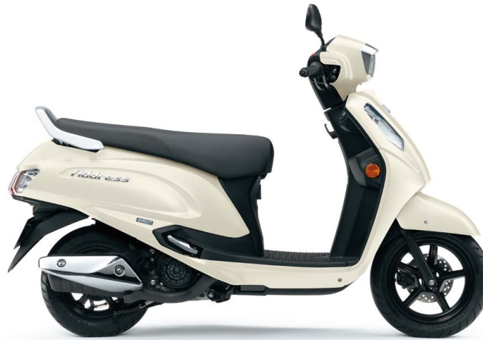
Pearl Grace White (Q1S)