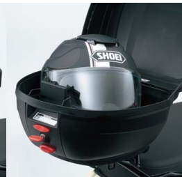
Cushion for Top Case