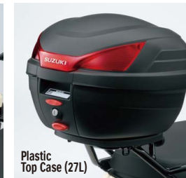
Plastic Top Case (27L)