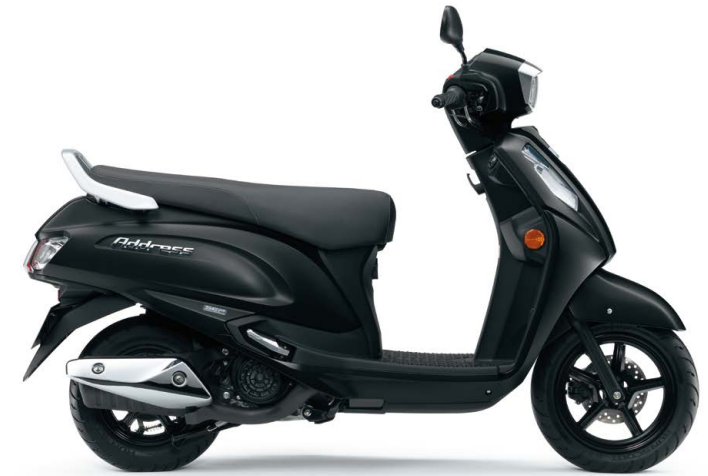
Metallic Mat Black No.2 (YKV)