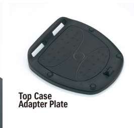
Top Case Adapter Plate