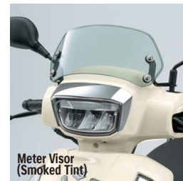
Meter Visor (Smoked Tint)